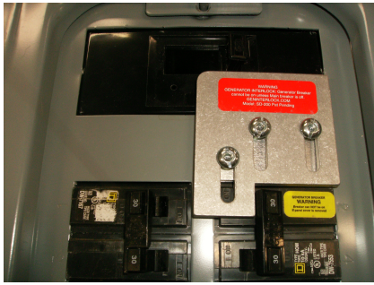
HOMELINE Main on

Step 7: Re-Install panel cover, Verify proper operation of interlock. Main breaker ON , generator breaker OFF and generator breaker CAN NOT be turned on. Generator breaker ON , main breaker OFF and main breaker CAN NOT be turned on.