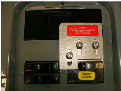
QO Main On